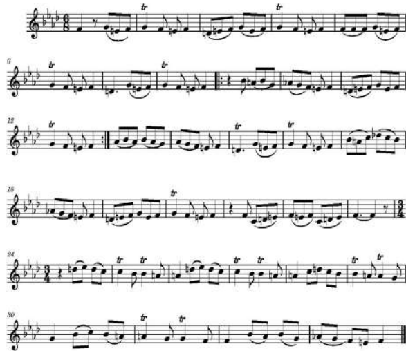
Note example 6. "Gazagi" dance [4]