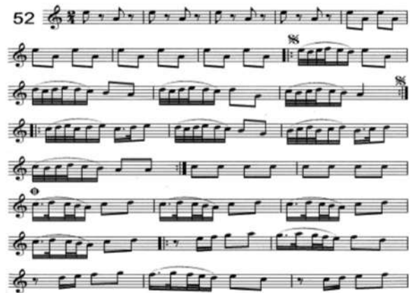
Note example 7. "Sheikh Shamil" dance [13]