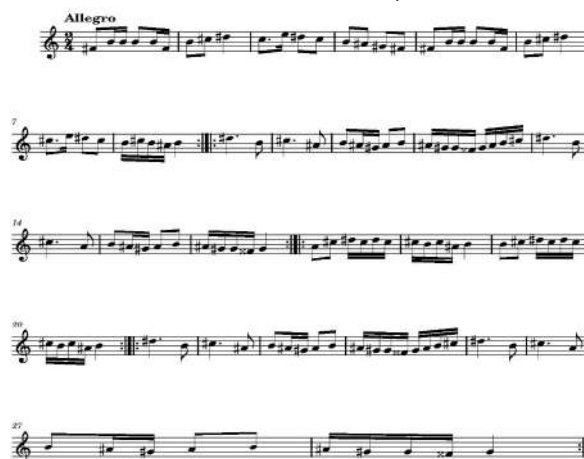
Note sample 5. "Gamaresky" dance

Collected and wrote notes: Gunay Mammadova