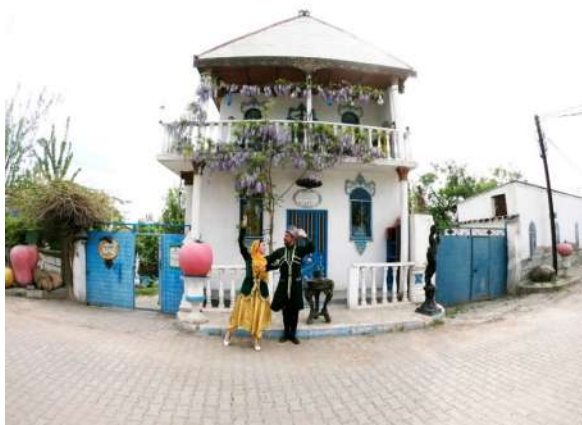
Photo 7. "Gamaresky" dance (İğdir/Malakli, 2024. Baydar dance group)

One of the most loved and performed dances in the İğdir region is the game air called "Gamaresky". Sometimes it is also called "Gamar dance". Based on the information provided by the older generation living in the region, we can say that this dance was performed by an old woman named Gamar. Since then, the name of this dance has been called "Gamar dance". Later, when it passed from language to language, the main pronunciation of the word was changed, and the dance is known today as "Gamaresky" in İğdir. Later, this dance was played by old men and women as a duet, but the lively and cheerful melody of the dance was loved and played by the younger generation.