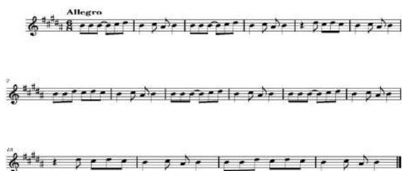
Note example 4. "Arhaji" yalli (part II)

One of the most loved and performed dances in the İğdir region is the game air called "Gamaresky". Sometimes it is also called "Gamar dance". Based on the information provided by the older generation living in the region, we can say that this dance was performed by an old woman named Gamar. Since then, the name of this dance has been called "Gamar dance". Later, when it passed from language to language, the main pronunciation of the word was changed, and the dance is known today as "Gamaresky" in İğdir. Later, this dance was played by old men and women as a duet, but the lively and cheerful melody of the dance was loved and played by the younger generation.