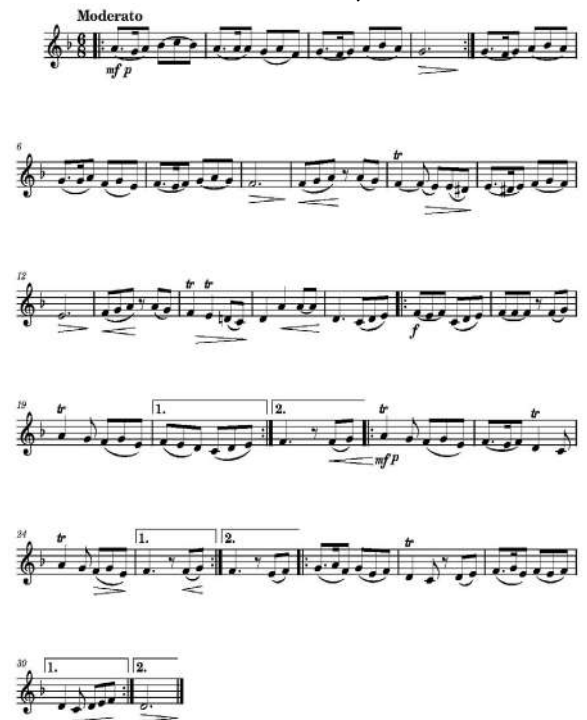
Note example 8. "Ayshat" dance [4]

One of the most popular dances in İğdir is the "Ayshat" dance. The name of this dance is one of the names often given to girls by the people of İğdir. This dance, composed by the famous harmonica player Teyyub Demirov, is among those that haven't been forgotten for many years. This dance, which is rarely performed at Azerbaijani weddings in modern times, is performed so much at İğdir and Kars district celebrations that those who do not know the origin of this dance consider it a musical example of Kars folklore. The sheet music example of the dance was included in Rauf Bahmanlı's collection of sheet music "Azerbaijani folk dances".