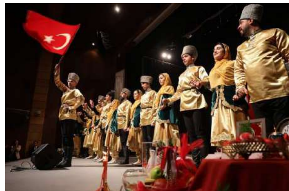
Photo 6. İğdir bar. (İğdir Cultural center, 2023/ Baydar dance group)